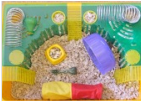
Dwarf Hamster Cage - top view