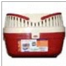
Hamster Travel Cage