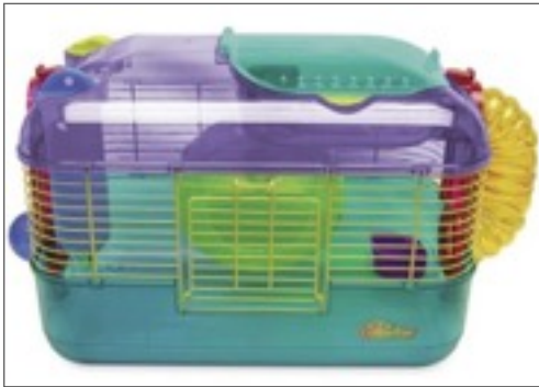
Custom made Hamster Cage