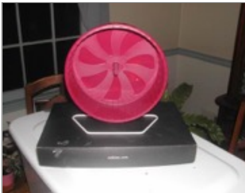
Hamster wheel with solid surface to avoid injuries For Syrian Hamsters, make sure the wheel is big enough