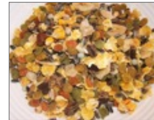
Fruit and Nut Mix